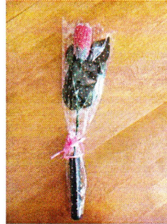
$6 (16" flower comes wrapped with bow and lights up!)

To order, please complete the information below and include a check (made out to Fairview PTO) or cash for the total amount. Payment must be included with your order. Some extras will be available for sale at the show, but we cannot guarantee how many. These will be distributed to the actors opening night of the show. All orders are due by Friday, January 19th, in an envelope marked to the attention of Becky Thal. For questions, email rebmurphythal@gmail.com.